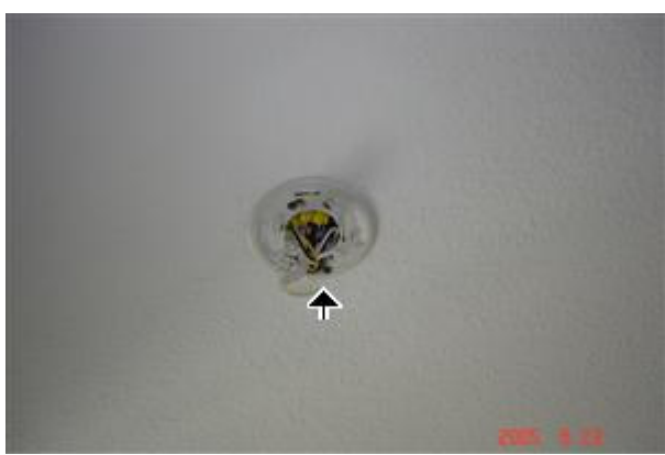
2.1 Picture 1

Report Identification 1701 Cimarron Tr. Report# Sample _____