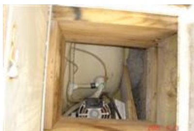
4.3 Picture 1

Report Identification 1701 Cimarron Tr. Report# Sample