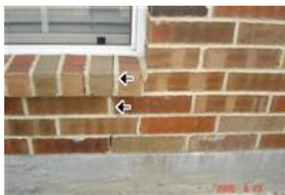
1.4 Picture 1