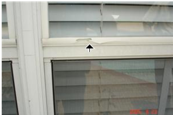
1.7 Picture 1