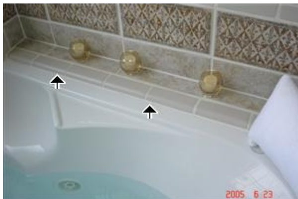
4.1 Picture 1

4.2 WATER HEATER EQUIPMENT (Report as in need of repair those conditions specifically listed as recognized hazards by TREC Rules) WATER HEATER POWER SOURCE: GAS (QUICK RECOVERY) Comments: