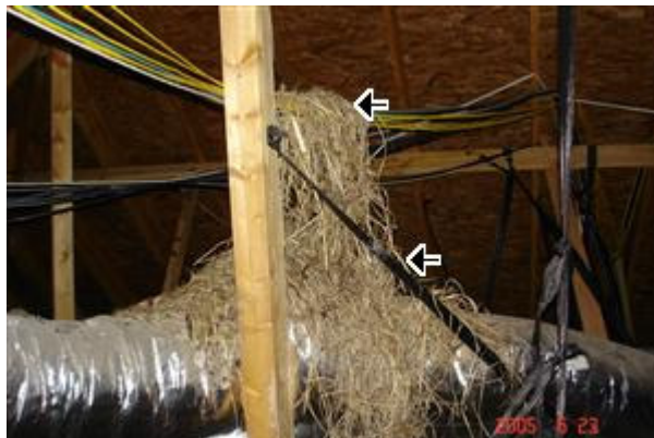
1.3 Picture 1