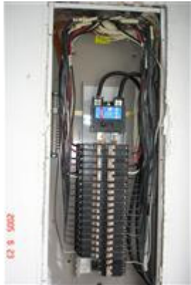
2.0 Picture 2

2.1 BRANCH CIRCUITS-CONNECTED DEVICES AND FIXTURES (Report as in need of repair the lack of ground fault circuit protection where required.)