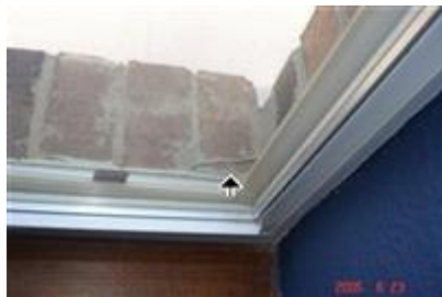
1.4 Picture 5