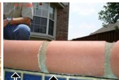
7.0 Picture 2