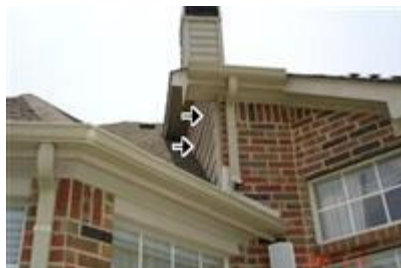
1.4 Picture 3