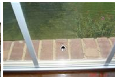
1.4 Picture 4