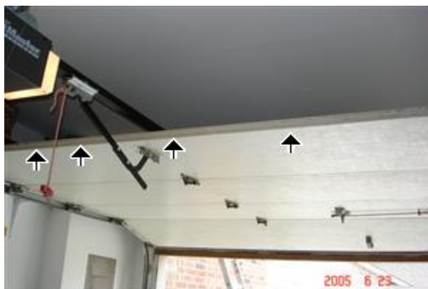
1.6 Picture 1