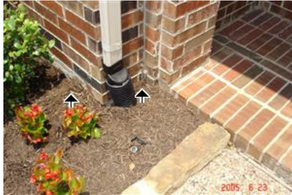
1.1 Picture 1