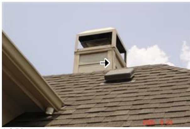
1.8 Picture 1