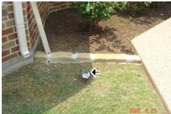
1.1 Picture 4