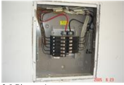
2.0 Picture 1