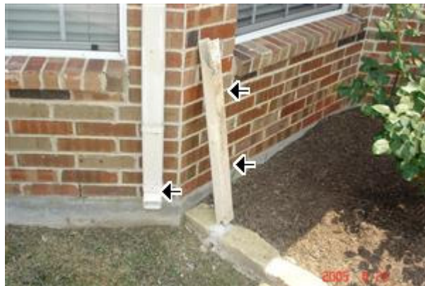
1.1 Picture 3