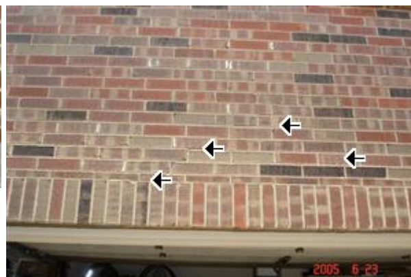
1.4 Picture 2