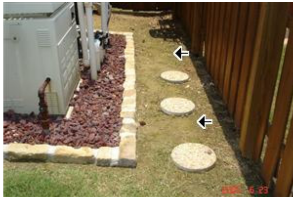
1.1 Picture 2